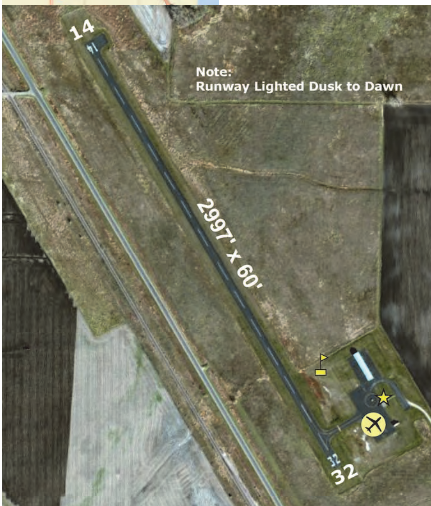
Herman Municipal Airport