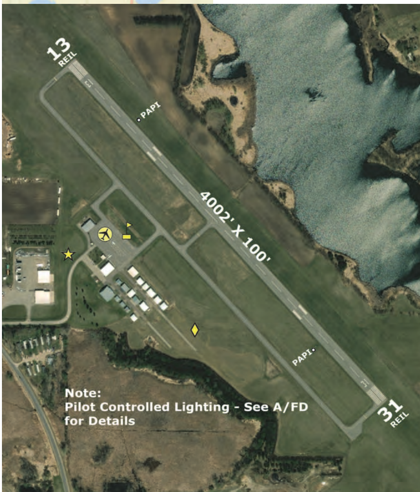
Litchfield Municipal Airport